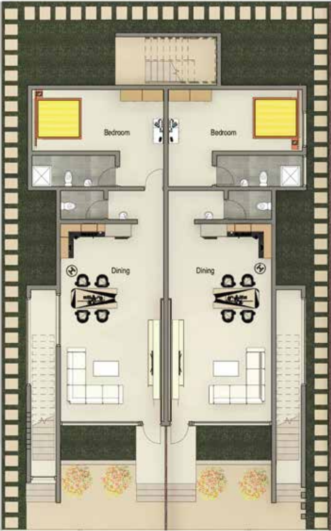
FIRST FLOOR PLAN WITH 2 UNITS