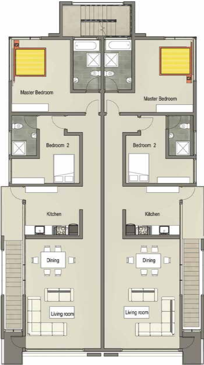
FIRST FLOOR PLAN WITH 2 UNITS