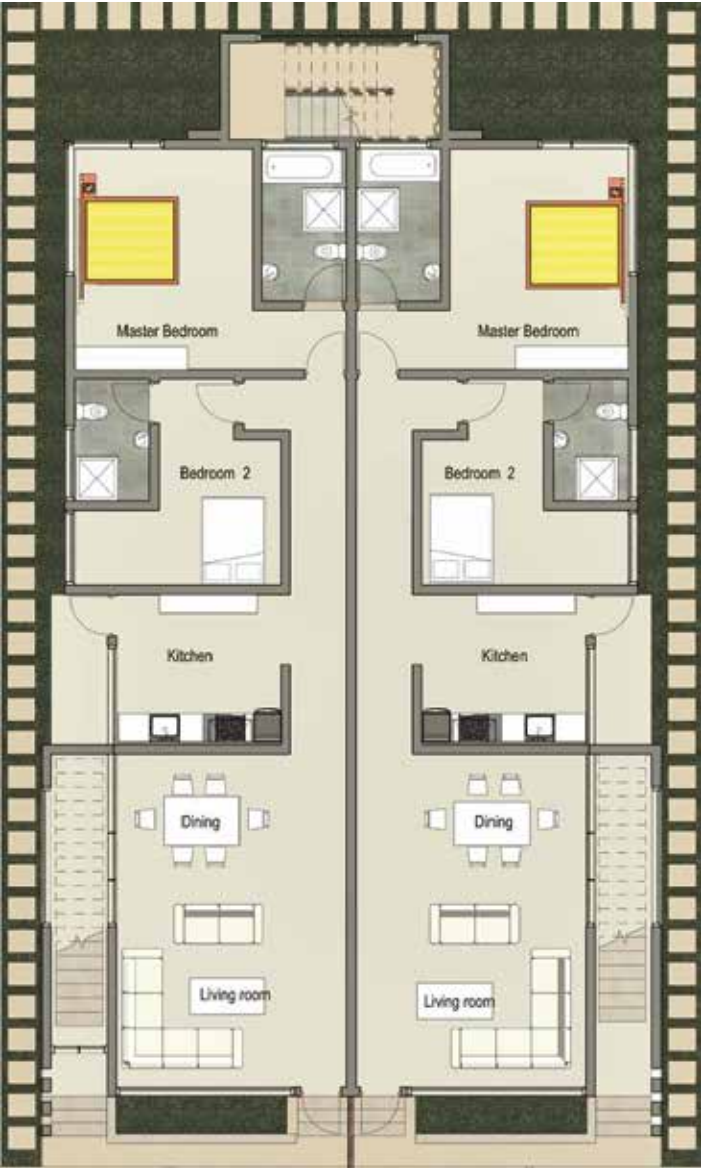
GROUND FLOOR PLAN WITH 2 UNITS